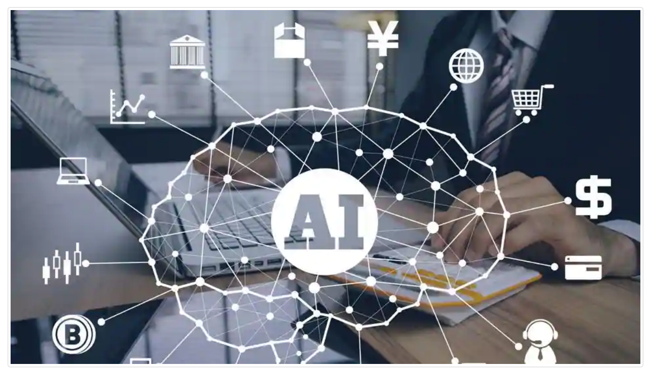
Registration for the festival is free and will have free and will include workshops, games and exhibits.

Artificial intelligence-generated art, AI (artificial intelligence) driverless cars, and brain-controlled helicopters to be major attractions at the Indian Science Festival 2020 which will be held at the Indian Institute of Science Education and Research (IISER), Pashan, on January 11 and 12.