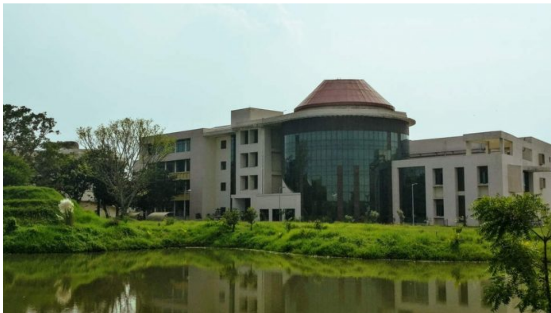
The IISER Kolkata campus | IISERKol.ac.in